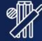
Cricket Practice Net